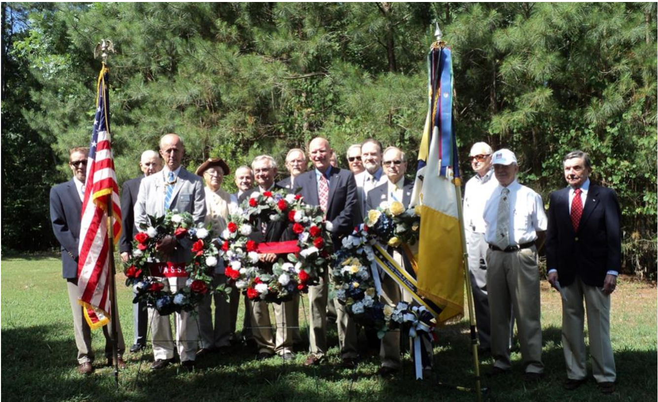
Members of the Sons of the American Revolution gathered to conduct a memorial service for Revolutionary War patriots who died in 1781 at the Spencer's Ordinary battle with British troops near Williamsburg.